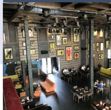
The Hard Rock Café in close proximity to the exhibition halls.