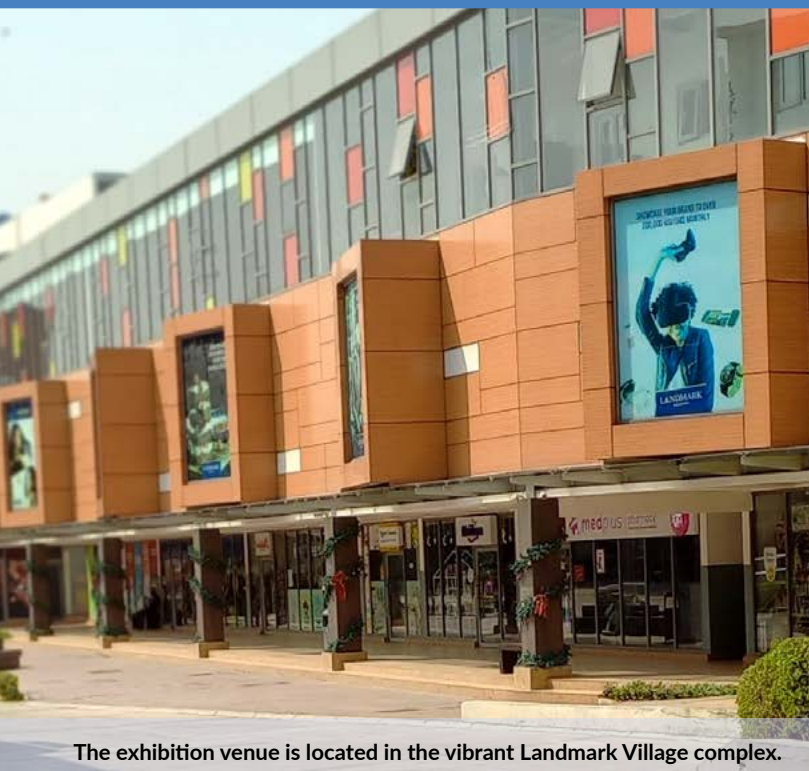
The exhibition venue is located in the vibrant Landmark Village complex.