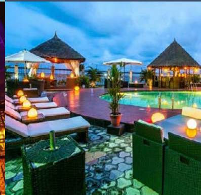
The leisure area of the Protea by Marriott Hotel Kuramo Waters.