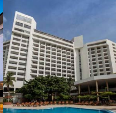
The Eko Hotel & Suites, only a short drive away from the exhibition venue.