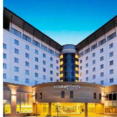
Four Points by Sheraton Hotel.