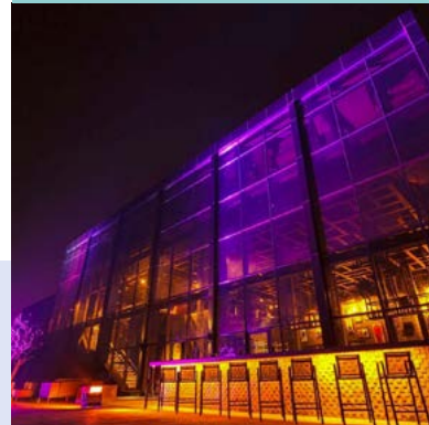
Restaurant within the exhibition centre complex.